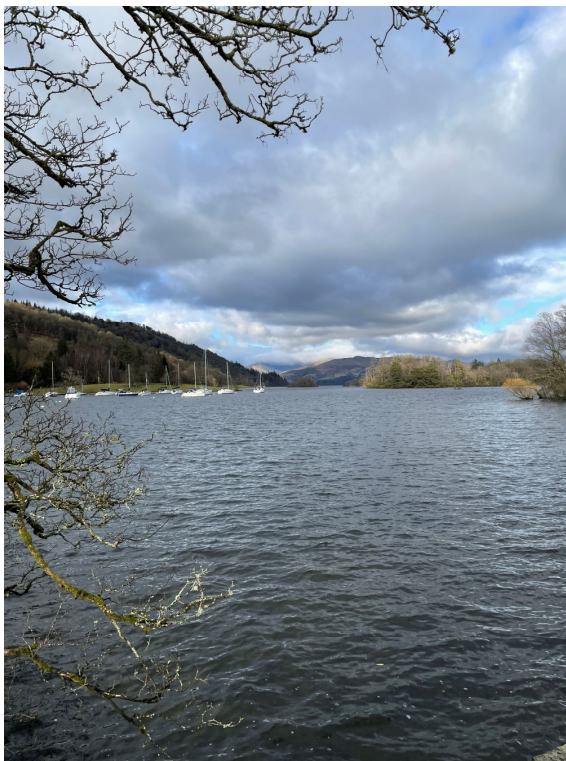
(Same view, different perspective)

I also reflected that coming to a difficulty from another angle and not being so rigid and deal with things in the same way as we always do, we get to a different viewpoint and often see a clearer picture more quickly. This can mean that we need to be willing to listen to others and take other people's advice graciously.