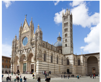
Exterior of Siena Cathedral

For me the highlight is a series of scenes from the life of Jesus by Duccio (1255/1260-1319) and his assistants which were painted in egg tempera on poplar. These were part of a large altarpiece known as the Maestà which was created for Siena Cathedral between 1308 and 1311. On the front the Virgin Mary is seated with Jesus as a child. They are surrounded by angels and saints and small pictures of stories about Mary's life and the childhood of Jesus. On the back are over 30 pictures illustrating various events in the ministry of Jesus leading up to his crucifixion.