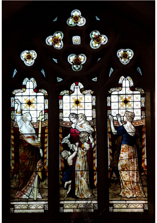
Stained glass window at Christ Church URC, Enfield, depicting Faith, Love and Hope (1 Corinthians 13:13), Ward and Hughes 1892

Tunes 'Au Clair de la Lune' (RS 197 'Jesus' Hands Were Kind Hands, Doing Good to All') 'Ruth' (RS 120 'Summer Suns Are Glowing Over Land and Sea')