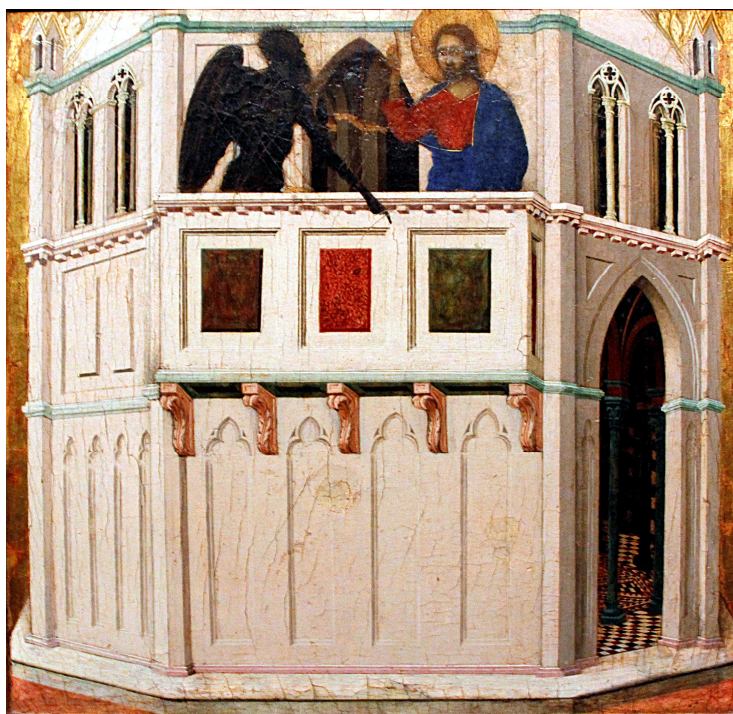
Left: The Temptation of Christ in the Temple , Duccio, Siena Cathedral Museum. Public domain image via Wikimedia Commons.

Front cover image by Khaosai Wongnatthakan on iStock.