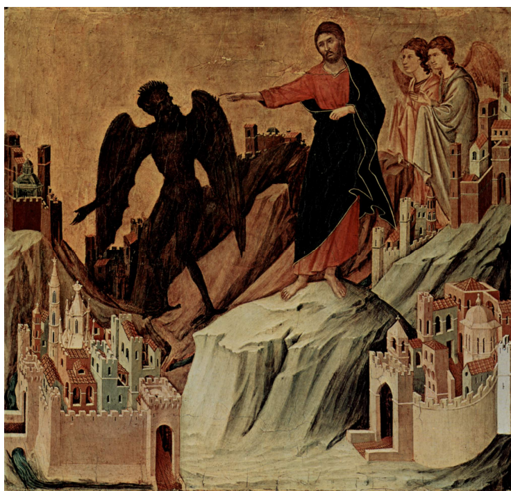
Right: The Temptation of Christ on the Mountain, Duccio, Frick Collection, New York.