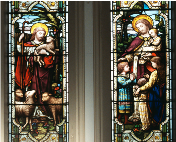
Stained glass windows

Stained glass windows installed in the side aisles between 1869 and 1881 by the London firm of Ward and Hughes illustrate sayings by Jesus and events from his life. (Christ Church URC also has