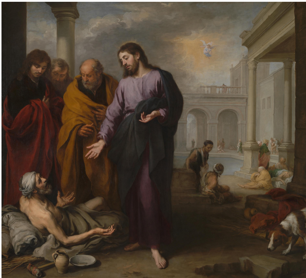
Christ Healing the Paralytic at the Pool of Bethesda , Murillo late 1660s, National Gallery, London. A related article by Stephen Gilburt can be found on page 19.