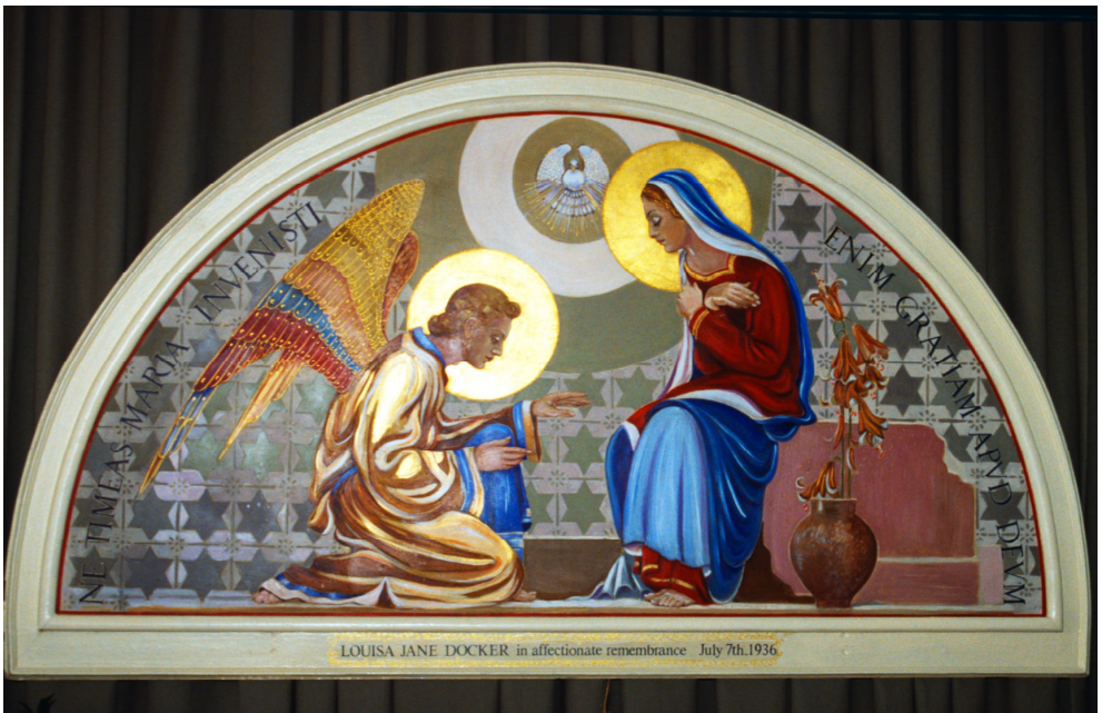
Wooden panel